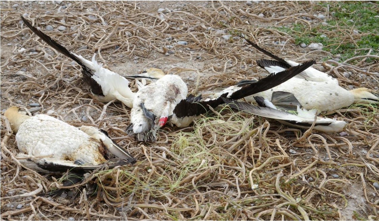
Figure 3. Three Cape Gannets ( Morus capensis ) entangled in monofilament fishing line at Bird Island, Algoa Bay, in November 2006 (Leshia Upfold). The central bird was foul hooked by the red and white lure on its breast, and thus probably caught on active fishing gear (= bycatch), but the other two birds were presumably entangled subsequently. Camphuysen (1990a) reported how four Northern Gannets ( M. bassanus ) struggling to free themselves from a net fragment attracted other gannets that also became entangled.

Reviews of seabird entanglement indicate that the number of species reported entangled in plastic items doubled from 51 species in the mid-1990s (Laist 1997) to 103 species by the end of 2014 (Kühn et al. 2015). Further species have been reported since then and combined with a search of Google Images there are now records for 144 species of seabirds (comparable to the groups covered by Laist 1997 and Kühn et al. 20015; PG Ryan unpubl. data). Across all birds, 255 species from 52 families were found to be entangled in synthetic materials, of which 211 were waterbirds (Table 3, PG Ryan unpubl. data). As Kühn et al. (2015) note, any waterbird is at risk from entanglement, and the number of affected species is bound to continue to increase. However, some families appear to be at greater risk than others. Across all seabirds, 35% of species have been recorded entangled, compared to only 10% of freshwater and coastal birds.