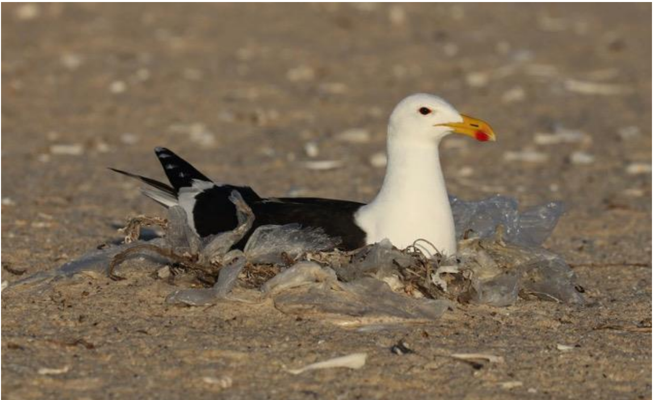
Figure 5. A Kelp Gull Larus dominicanus nest constructed largely from plastic at a site where there are few other natural materials for nest building; Strandfontein beach, December 2016.

However, Common Noddies ( Anous stolidus ) breeding at Inaccessible Island occasionally include short lengths of green rope in their nests (PGR pers. obs.). No other plastics have been recorded in their nests, and they sometimes drape the ropes near the nest rather than incorporating them into the nest structure, suggesting that they specifically select for this type of debris (see cover image). Lavers et al. (2013) found no evidence of selection for the type of debris in Brown Booby ( Sula leucogaster ) nests compared to adjacent beach litter at Ashmore Reef in the Timour Sea. They reported a weak preference for black items (possibly because they resembled twigs), but their sample sizes were small.