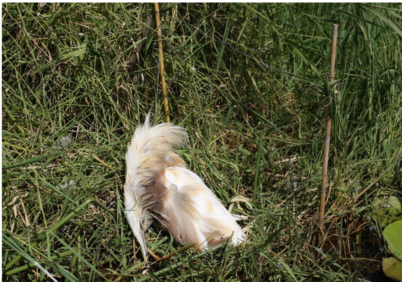
Figure 4. A Squacco Heron Ardeola ralloides killed in a snare probably designed to catch birds in Benguelu Swamp, Zambia, in May 2011. Birds escaping from such snares could be recorded as entangled.

Apart from Northern Gannets, entanglement appears to be a relatively uncommon event for most AEWA-listed species. Deliberate trapping of birds for food (Figure 4) and accidental bycatch in fishing gear probably greatly exceeds the impact of entanglement on AEWA-listed waterbirds.