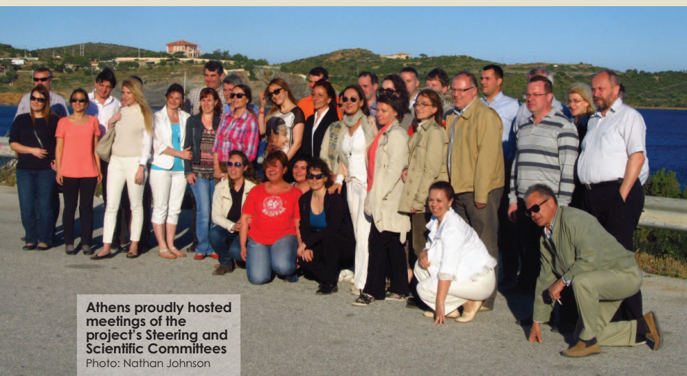
Athens proudly hosted meetings of the project's Steering and Scientific Committees