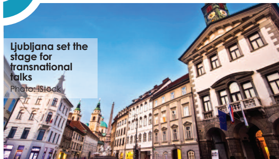
Ljubljana set the stage for transnational talks