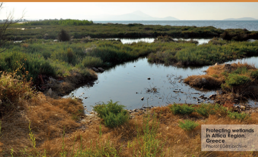
Protecting wetlands in Attica Region, Greece