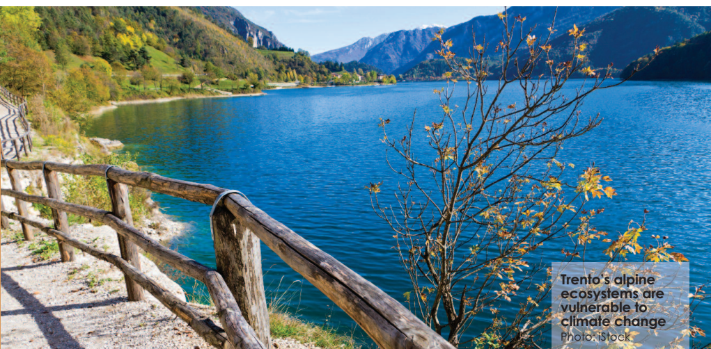
Trento's alpine ecosystems are vulnerable to climate change