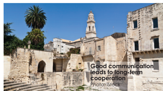
Good communication leads to long-term cooperation